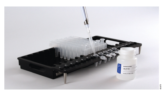
Figure 2. Setup and configuration of the deck tray(s). Elution Buffer is added to the elution tubes as shown. Plungers are in well #8 of the cartridge.

Figure 1. Maxwell<sup>®</sup> RSC Pathogen Total Nucleic Acid Cartridge. Preprocessed sample is added to well #1, and a plunger is added to well #8.